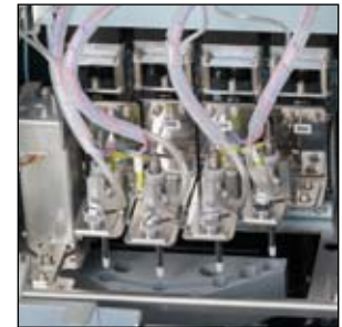
4 Wash Probes