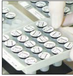
960 Test Cups