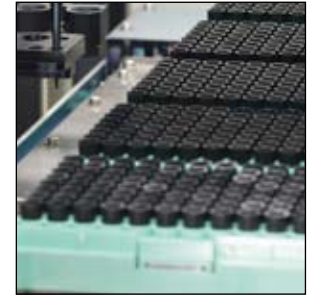
576 Pipette Tips